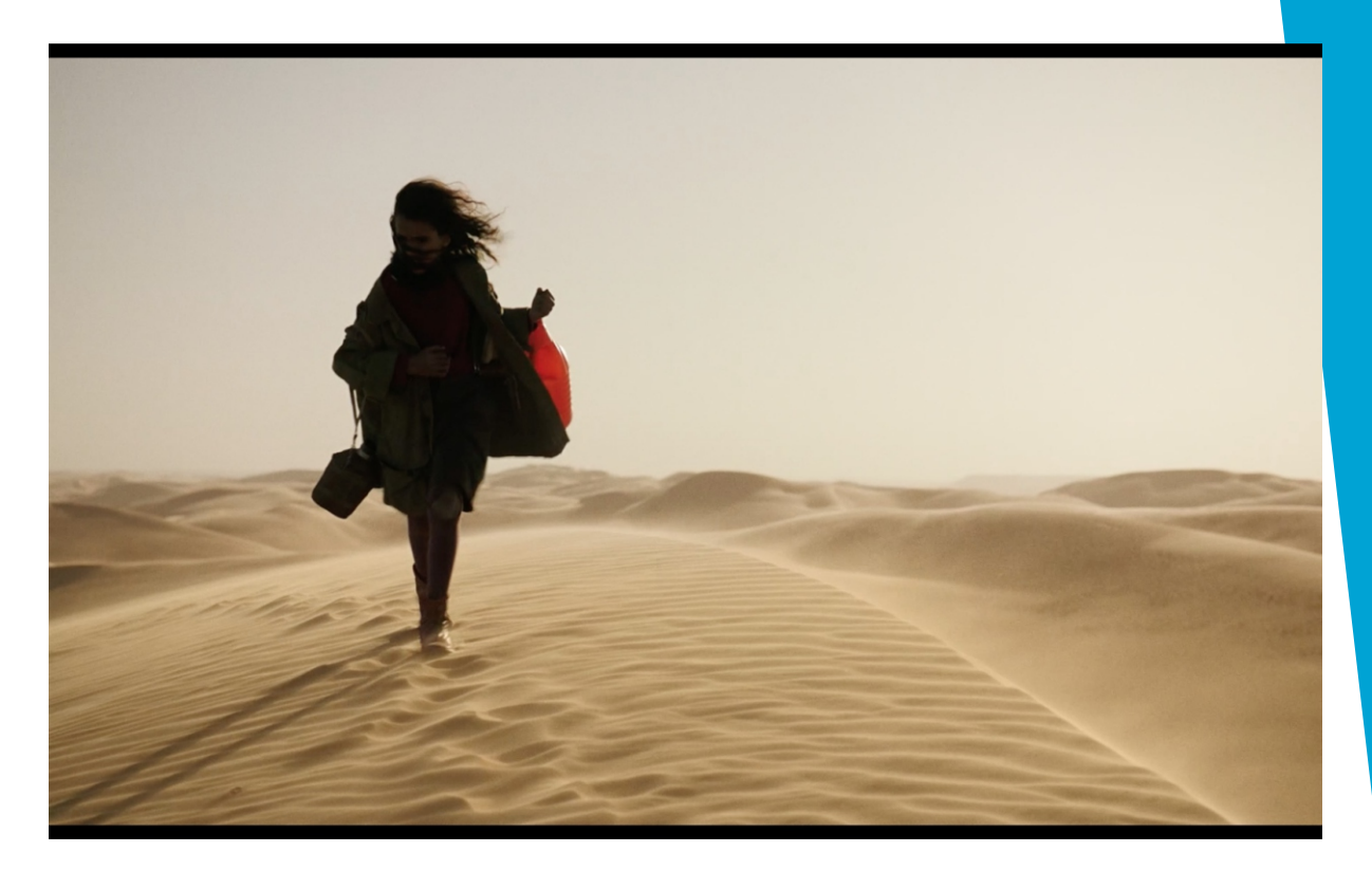
Algeria I 2019 I Arabic dialogue with English subtitles I 12 min

A little girl and only child in a village wandering in the middle of the Sahara, inventing games in a dying oasis.