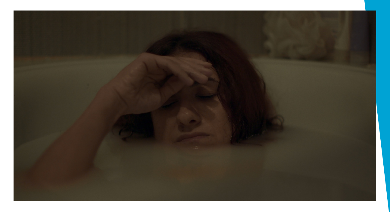
Kuwait, Sudan, Qatar, Egypt I 2020 I Arabic dialogue with English subtitles I 14 min

A woman with depression struggles to keep up appearances in front of her chirpy and driven office colleagues. An encounter with a dying cockroach in the office toilet develops into an absurd friendship, becoming the comforting companion she needs until she realizes its destructive effects on her life.