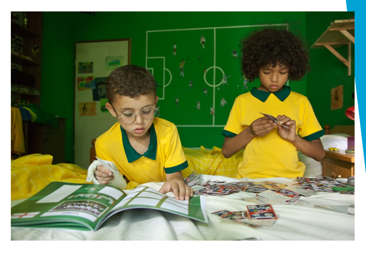
Germany, Palestine I 2019 I Arabic dialogue with English subtitles I 23 min

Trailer <a href="https://www.youtube.com/watch?v=2xYnrmXhzoY&feature=youtu.be">https://www.youtube.com/watch?v=2xYnrmXhzoY&feature=youtu.be</a>