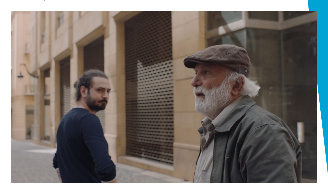
Lebanon I 2019 I Arabic dialogue with English subtitles I 14 min

People hold the memory of their cities, and vice versa. After-war modern Beirut and its people have lost their anchors towards a memoryless relationship.