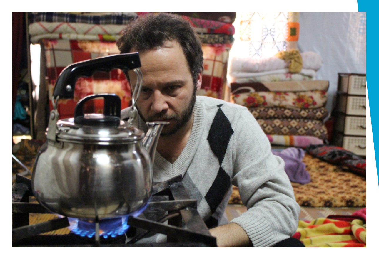
Syria I 2019 I Arabic dialogue with English subtitles I 15 min

Trailer <a href="https://www.youtube.com/watch?v=6fGLLvVgfKo&feature=youtu.be">https://www.youtube.com/watch?v=6fGLLvVgfKo&feature=youtu.be</a>