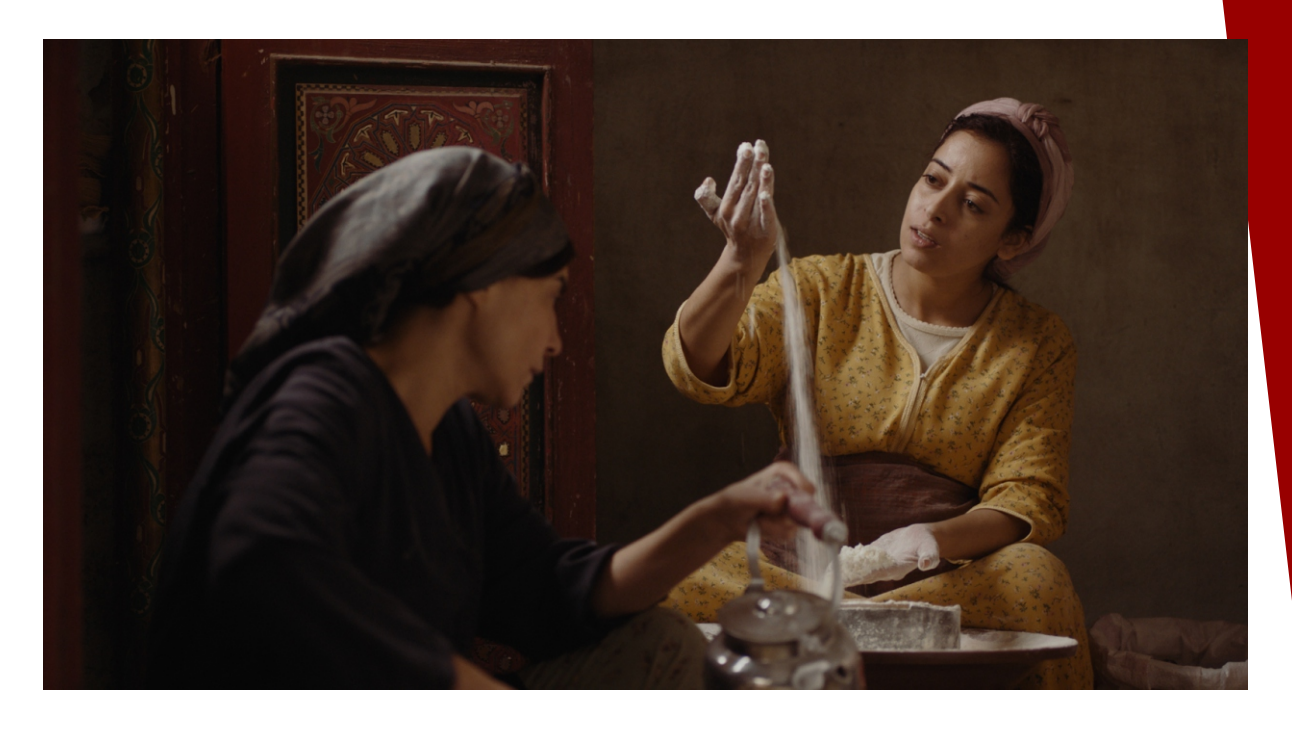
Morocco, France / 2019 / Arabic dialogue with Swedish subtitles / 98 min

Trailer <a href="https://www.youtube.com/watch?v=RO2rvCCVQLQ">https://www.youtube.com/watch?v=RO2rvCCVQLQ</a>