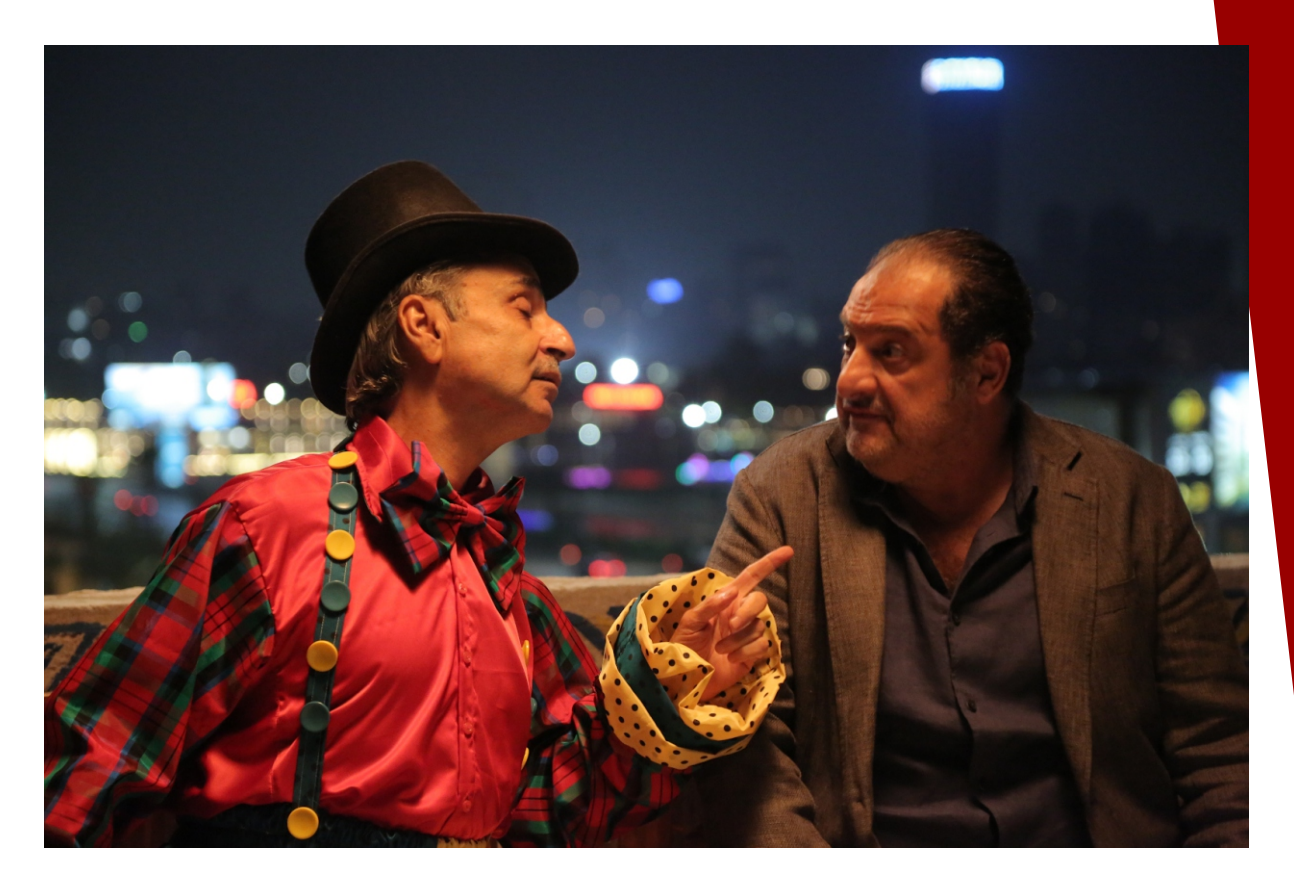
Egypt / 2019 / Arabic dialogue with English subtitles / 90 min

Trailer https://www.youtube.com/watch?v=E0bo24lWalo