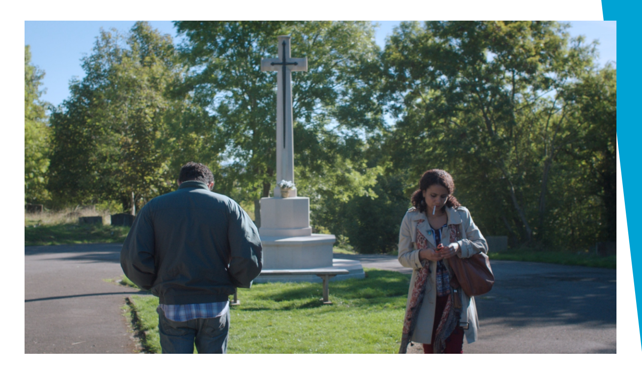
Egypt, United Kingdom I 2019 I Arabic dialogue with English subtitles I 11 min

Trailer <a href="https://www.youtube.com/watch?v=2A4CbevAw0w&feature=youtu.be">https://www.youtube.com/watch?v=2A4CbevAw0w&feature=youtu.be</a>